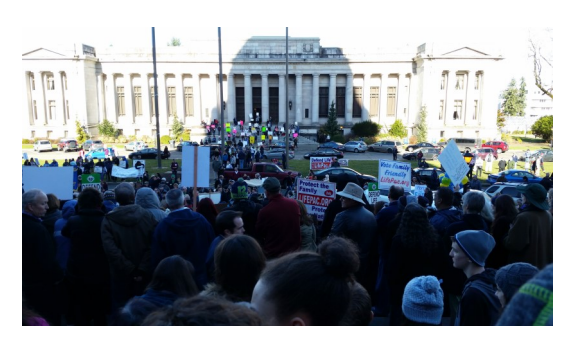
The March for Life.

Participation in Works of Mercy: Jesus makes it clear through His teaching on the Judgment of Nations in Matthew 25:31-46 that serving the least of our brothers and sisters is a way to "inherit the kingdom prepared" for us, and that if we don't we will be "cursed" and sent to "the eternal fire." Practicing the works of mercy will clearly help us grow in holiness. Whether it's a mission trip, helping to furnish a room at Open House Ministries, participating in the annual Walk-N-Knock, or traveling to Olympia for the March for Life, there are many opportunities organized through the Church to participate in the works of mercy.