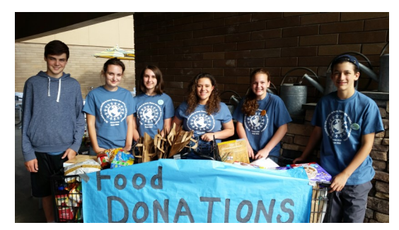
Missionaries at Agape feeding the Hungry

our Lenten Small Faith Sharing Groups. There are three groups meeting regularly to do bible studies together, bringing the total number of <u>adult participants</u> in learning programs to over 400. We have over 100 <u>adult catechists</u> to help teach nearly 420 youth, prepare over 360 people for sacraments, and to teach adults about God. There are opportunities throughout the year to participate in retreats and missions whether you are an adult or a youth, with over ten youth and five adult retreats hosted, along with three parish missions. There are many options for learning and teaching to help you come to know God and His will.