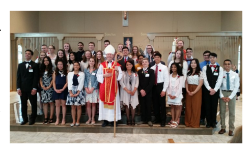
Confirmation strengthens the gifts we were given in Baptism to enable our Mission

What about encouraging others to receive the Sacraments of Initiation ?