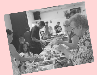
Digging in at the parish picnic, 2015